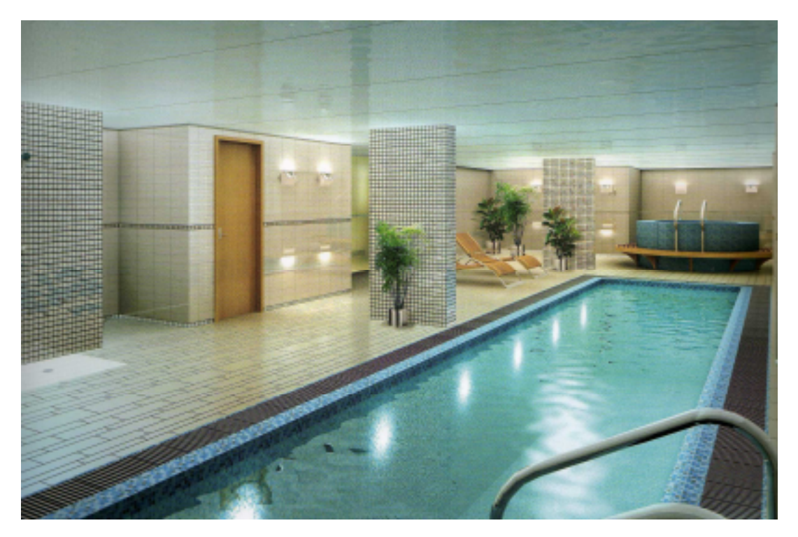
Arbitrage – Real Estate investments in London